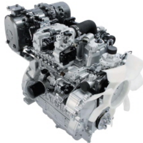
KUBOTA V3800 Engine

- Cooled EGR (Exhaust Gas Recirculation) EGR system recirculates a portion of exhaust gas back to the cylinder. The returned exhaust gas contains less oxygen, thereby lowering the combustion temperature and reducing NOx